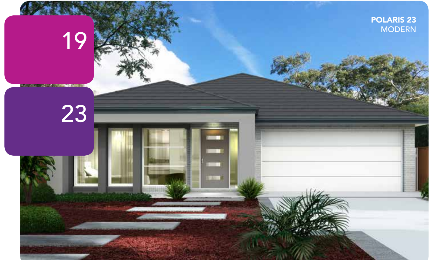
POLARIS 23 MODERN