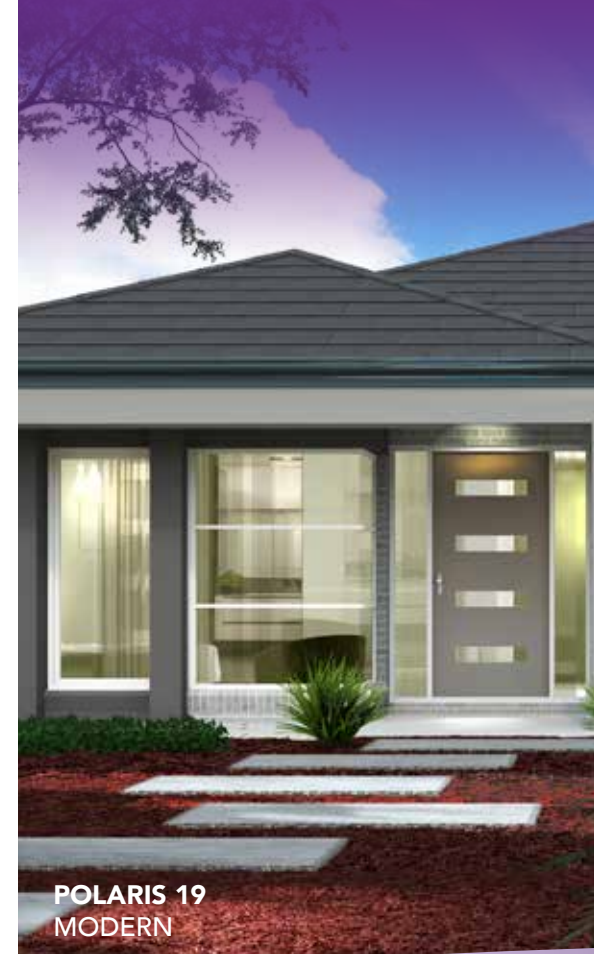
POLARIS 19 MODERN