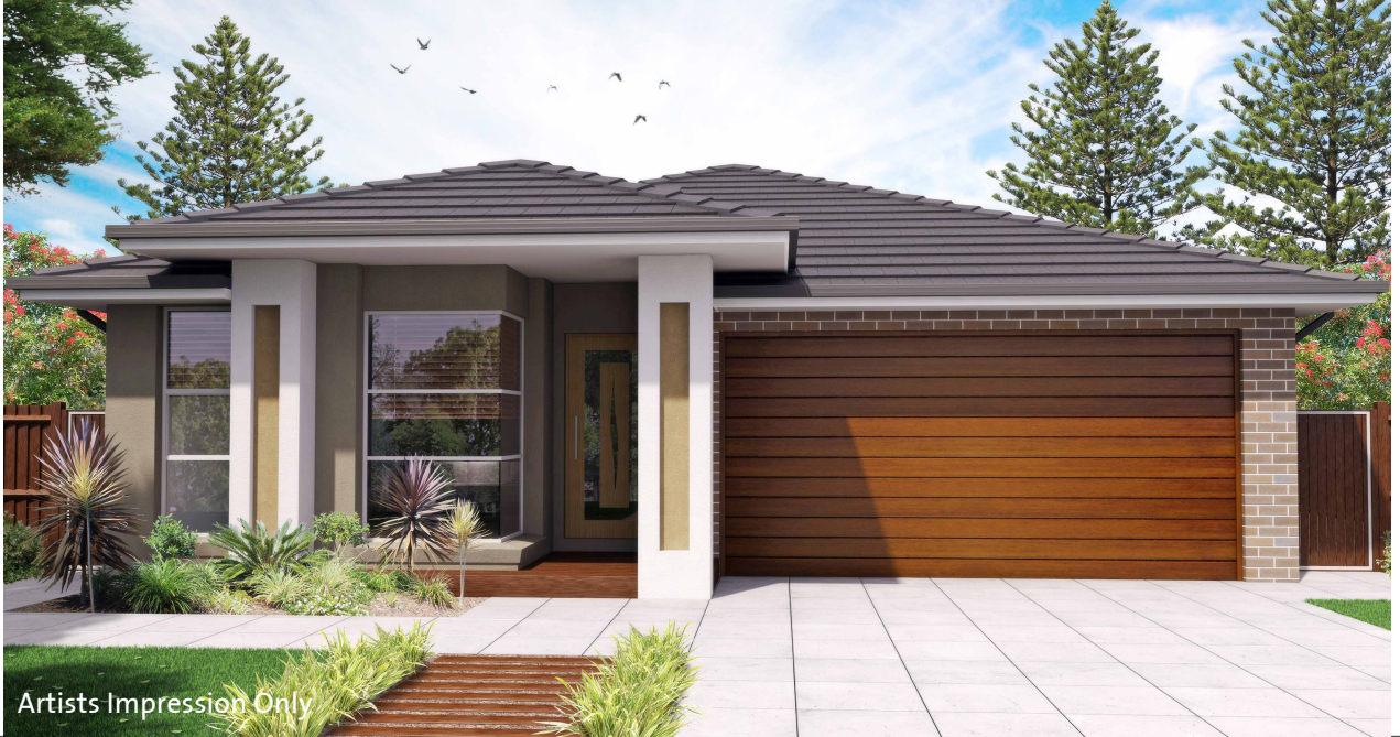
Artists Impression Only